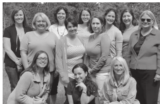
August 2015 Boot Camp attendees